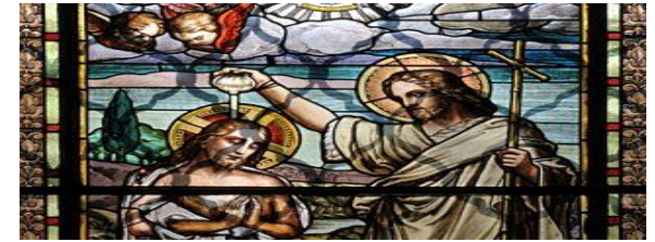
The Baptism of Jesus